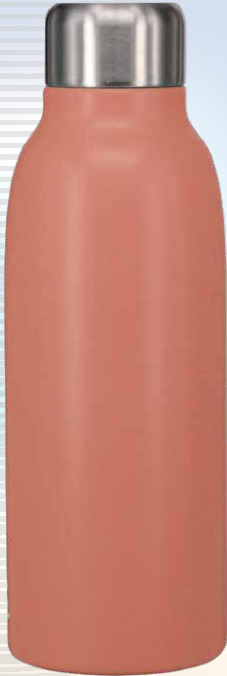
Item Nr : SS-465 Capacity : 18oz 540ml