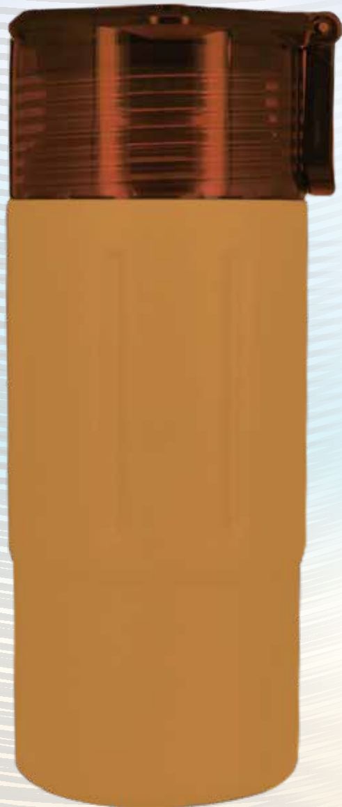
Item Nr : SS-758 Capacity : 16oz 480ml