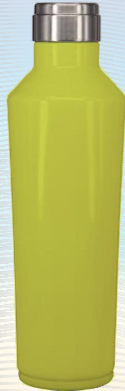
SS-461 30oz 900ml