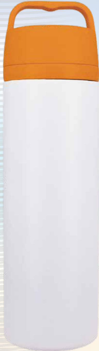
Item Nr : SS-705 Capacity : 18oz 530ml