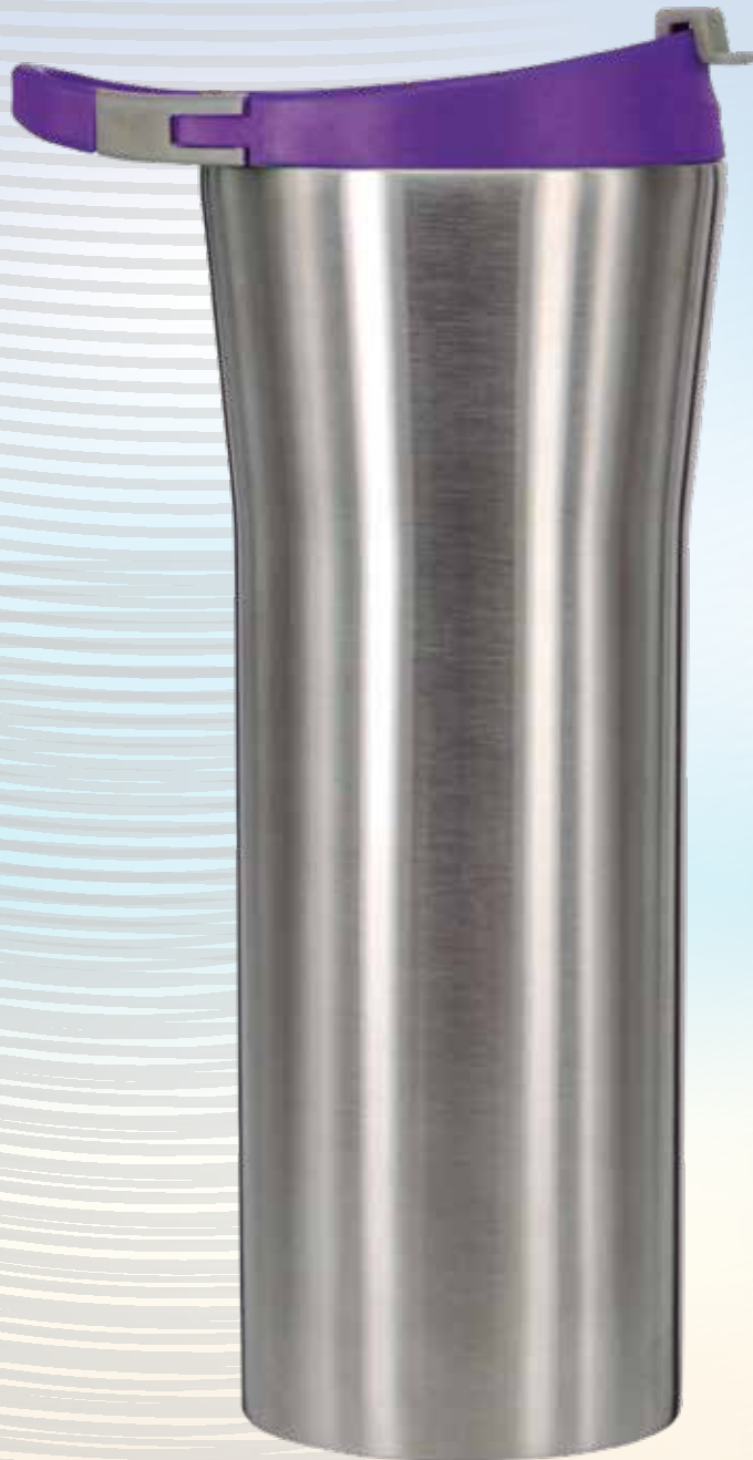
Item Nr : SS-466 Capacity : 22oz 660ml