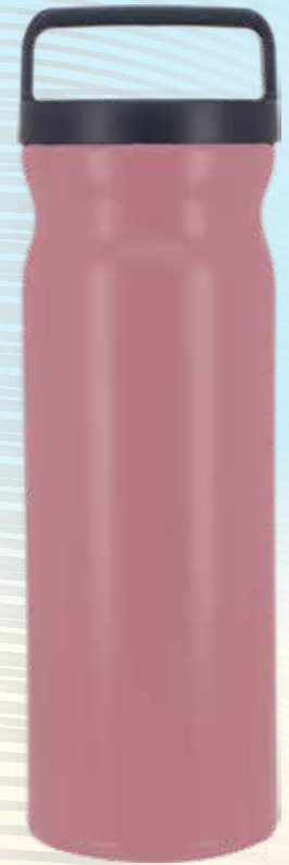
SS-649 17oz , 510ml