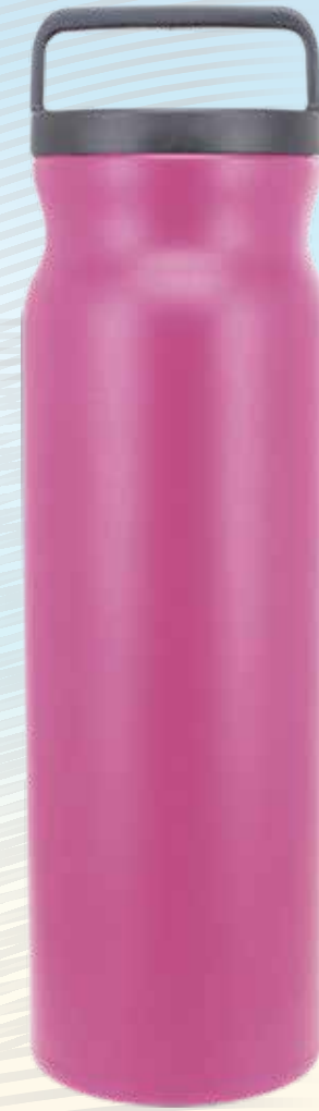
SS-663 25oz 740ml