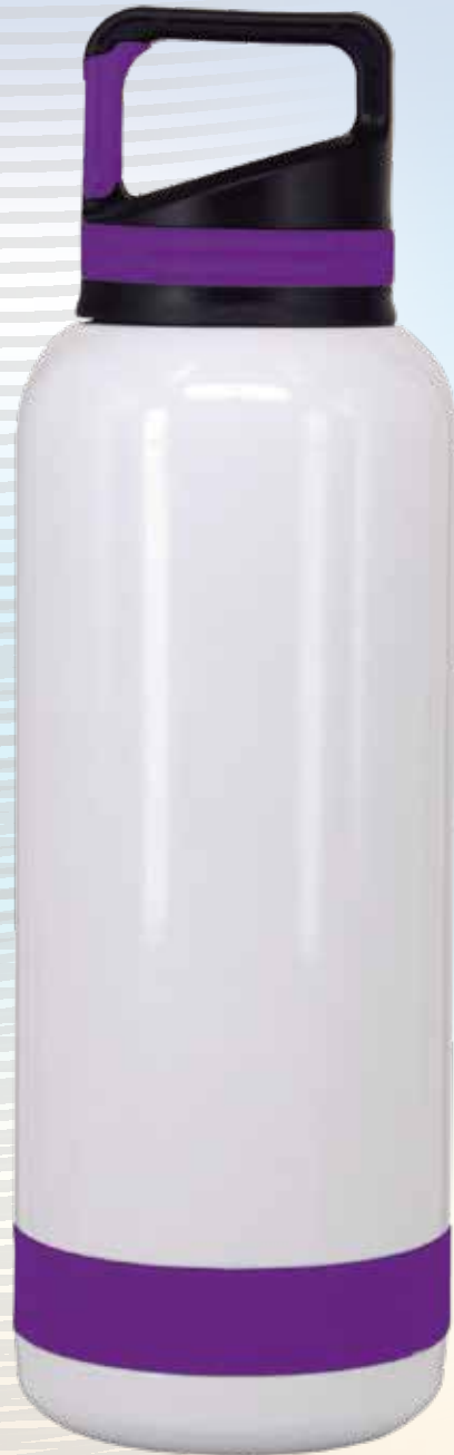
Item Nr : SS-469 Capacity : 27oz 810ml