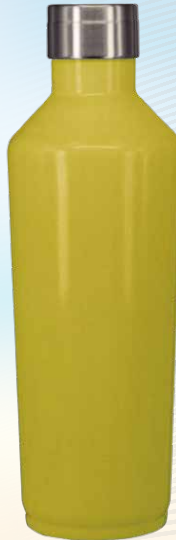
SS-462 18oz 540ml