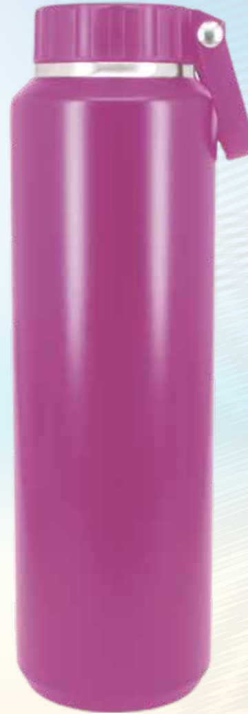
SS-650 24oz , 720ml