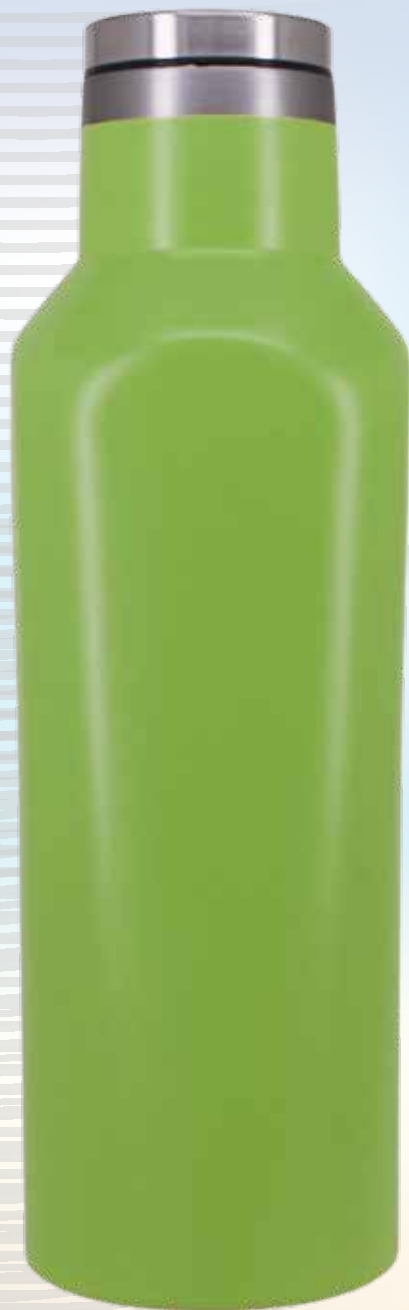
Item Nr : SS-661 Capacity : 17oz 510ml