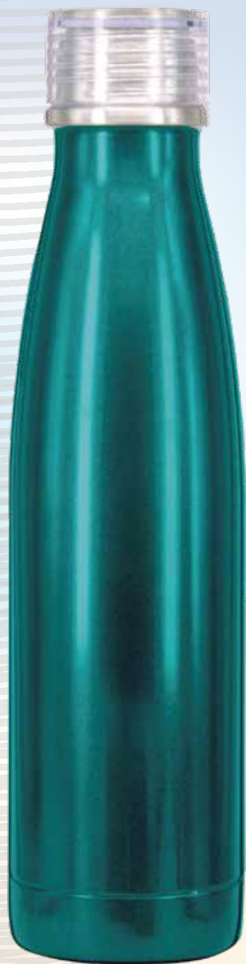
Item Nr : SS-463 Capacity : 18oz 540ml