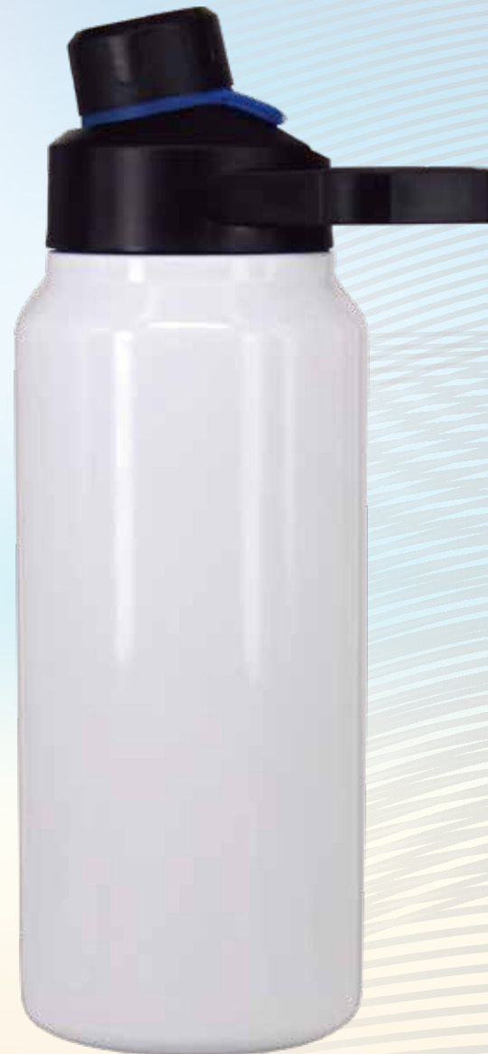
SS-467 29oz 870ml