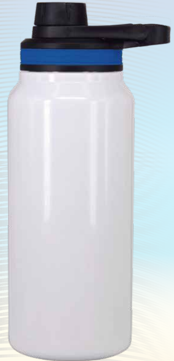
SS-468 29oz 870ml