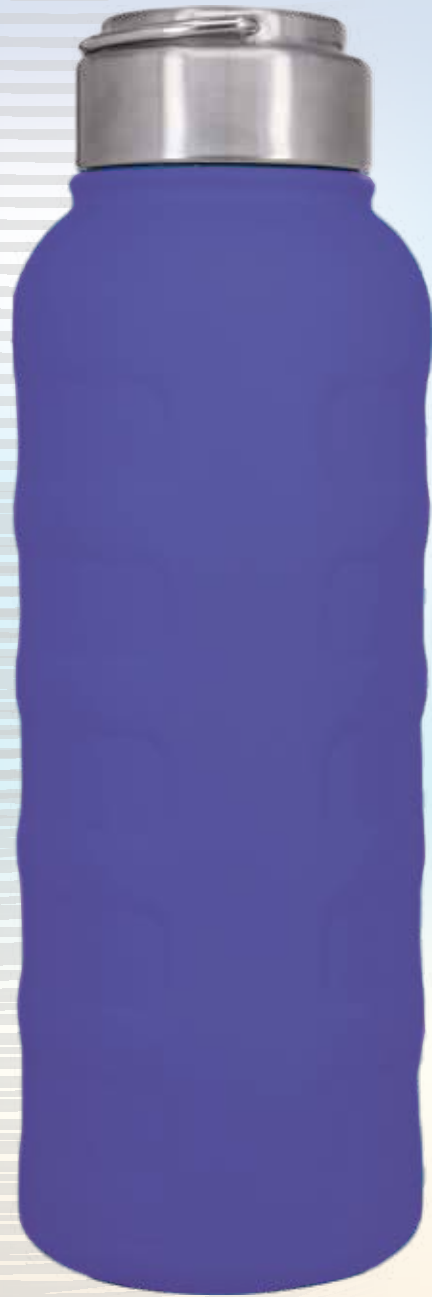
Item Nr : SS-755 Capacity : 32oz 960ml