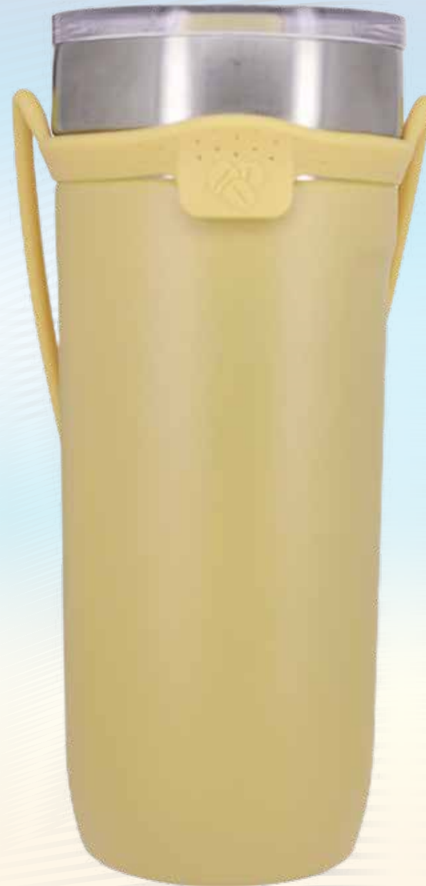
Item Nr : SS-773 Capacity : 23oz 690ml