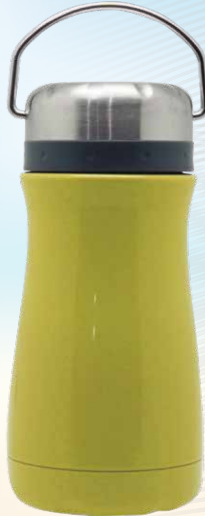
SS-502 12oz 360ml