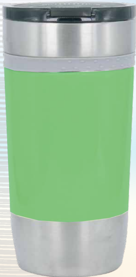
Item Nr : SS-553 Capacity : 19.5oz 556ml