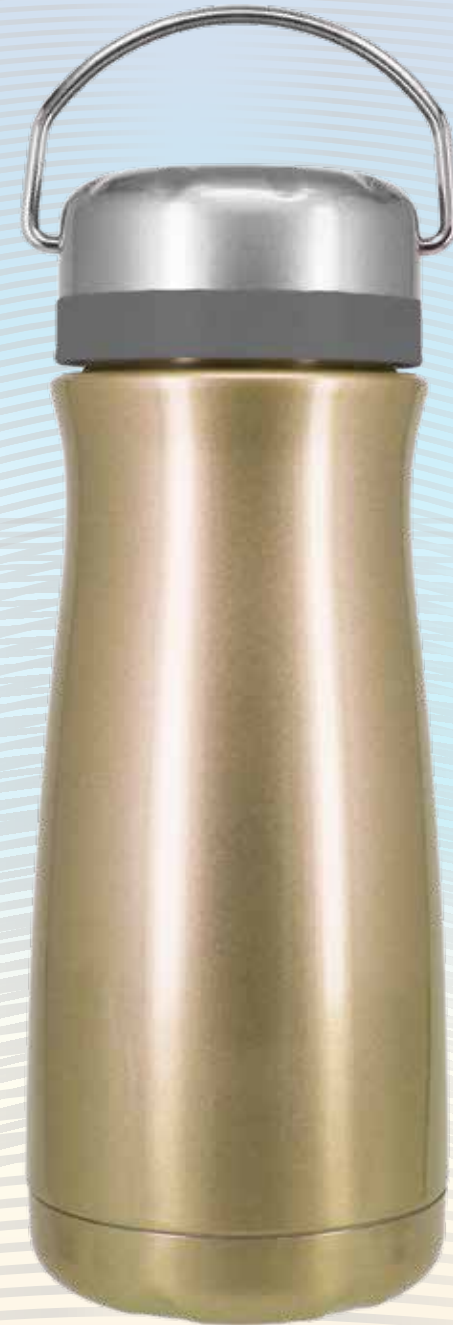
SS-698 18oz 530ml