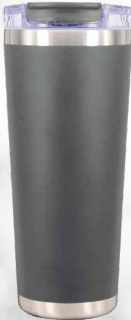
Item Nr.: SS-369 Capacity : 22oz , 660ml