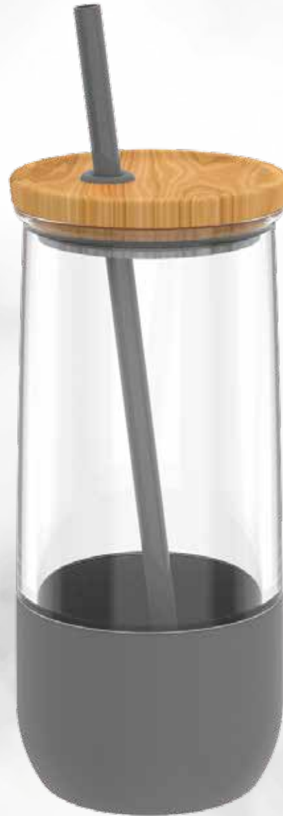
Item Nr.: DP-368 Capacity : 20oz , 600ml