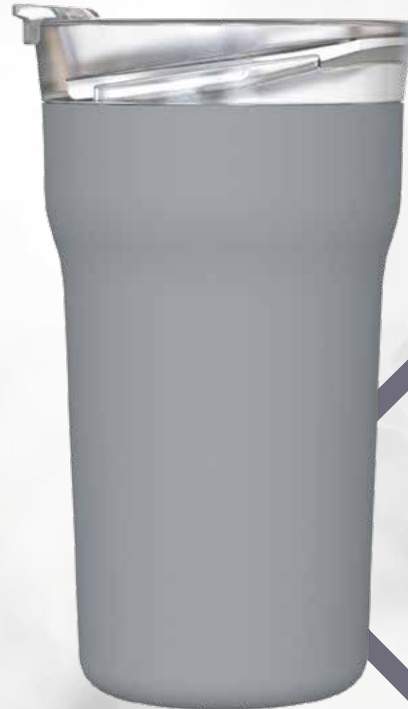
Item Nr.: SS-533 Capacity : 12oz , 360ml