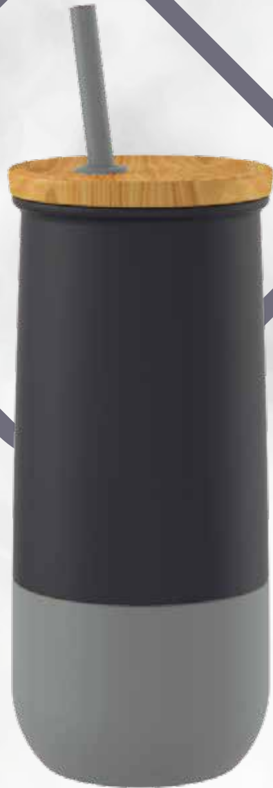
Item Nr.: SS-487A Capacity : 20oz , 600ml