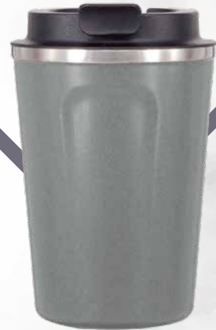
Item Nr.: SS-455 Capacity : 13oz , 390ml