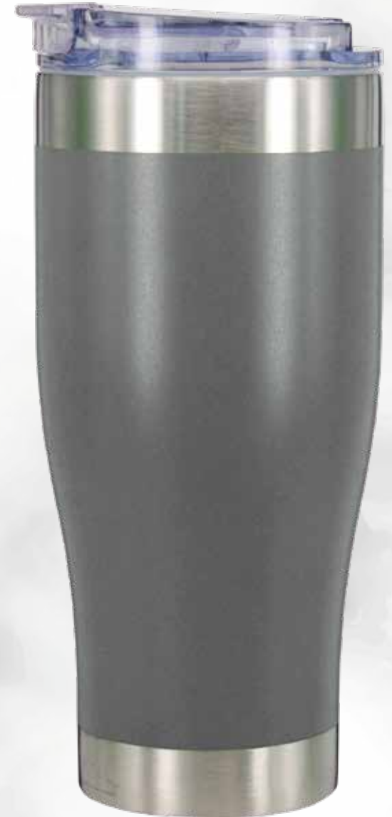
Item Nr.: SS-337 Capacity : 28.5oz , 850ml