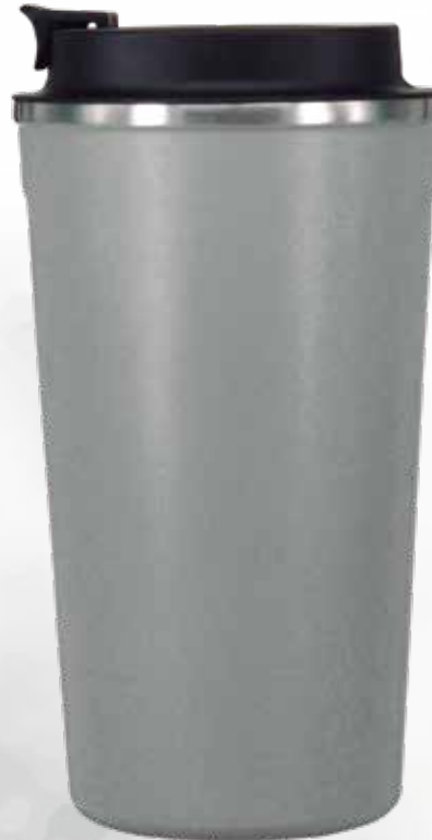
Item Nr.: SS-456 Capacity : 17oz , 510ml