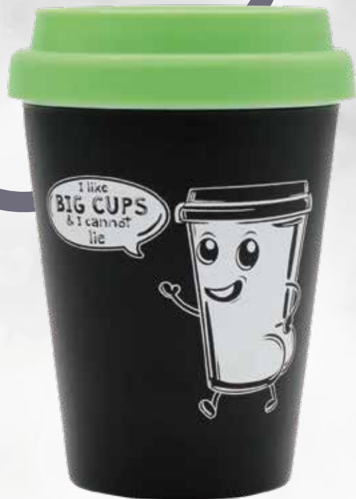
DP-377 9oz , 270ml