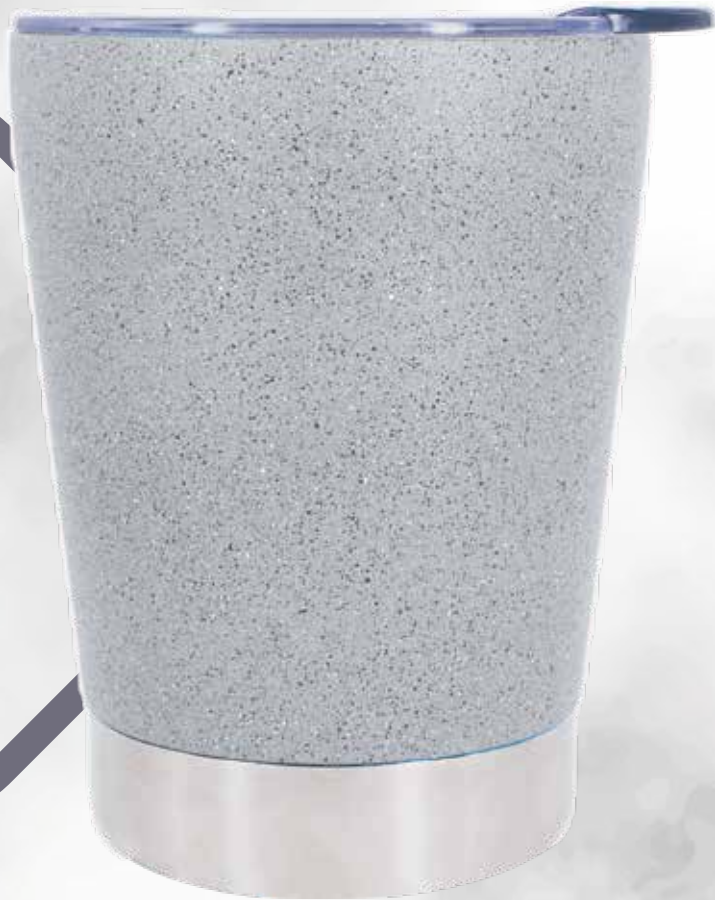
Item Nr.: SS-621 Capacity : 11.5oz , 350ml