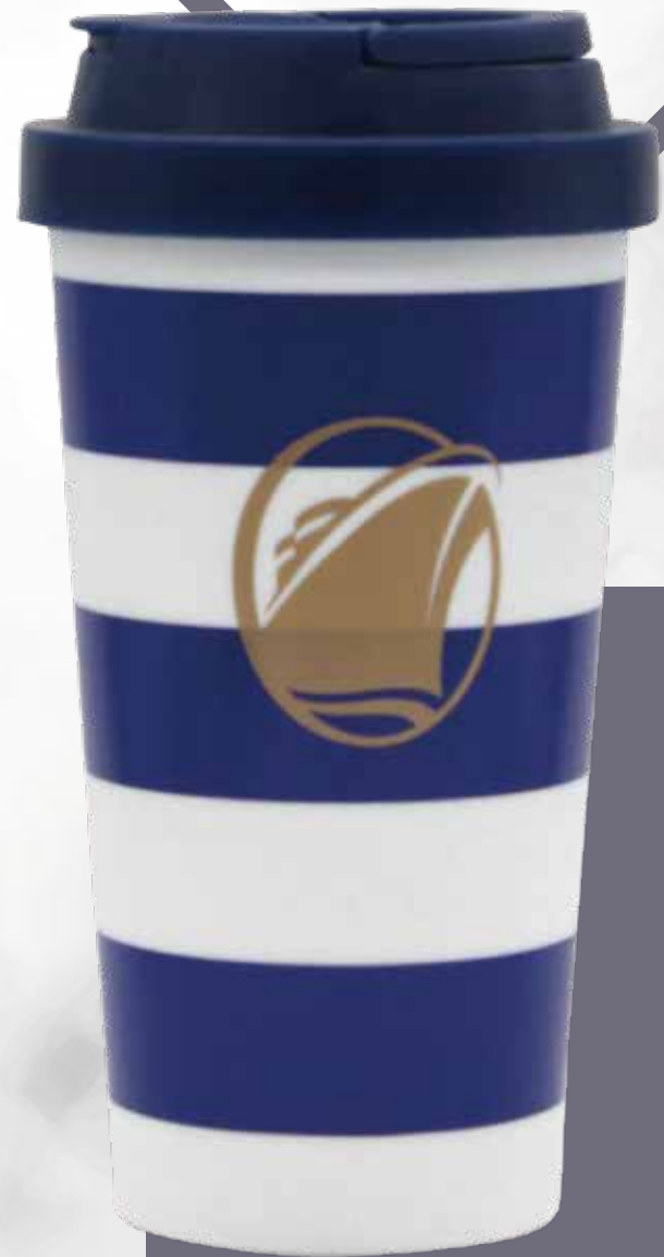
DP-379 17.3oz , 493ml