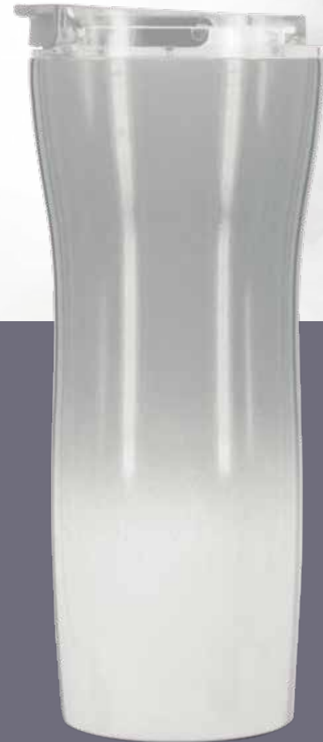
Item Nr.: SS-347 Capacity : 20oz , 600ml