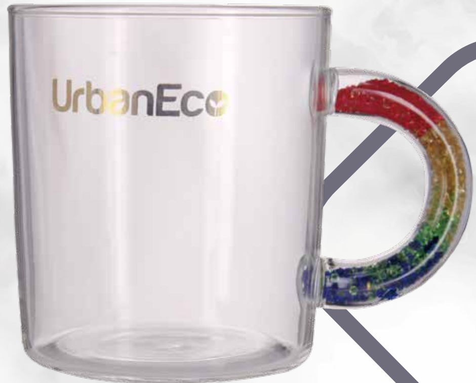
Item Nr.: GL-121A Capacity : 16oz , 380ml