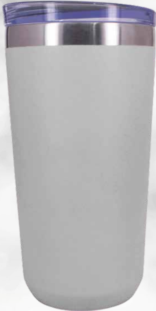
Item Nr.: SS-707 Capacity : 15oz , 450ml