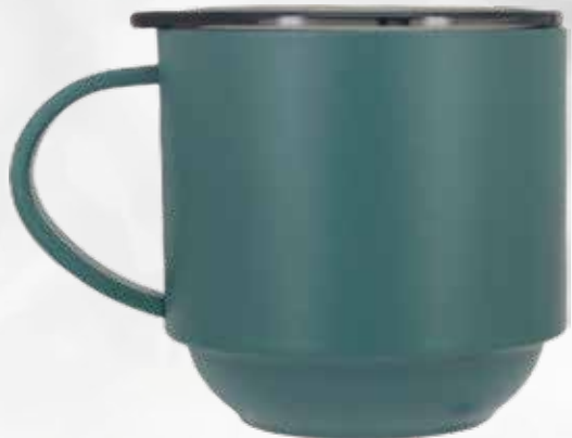
Item Nr.: SS-764 Capacity : 10oz , 300ml