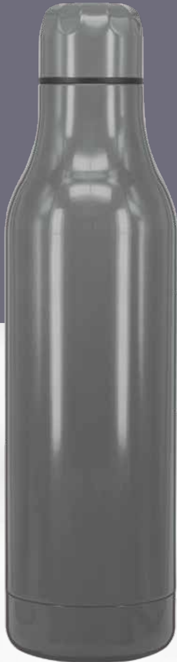
Item Nr.: SS-371 Capacity : 18.5oz , 550ml