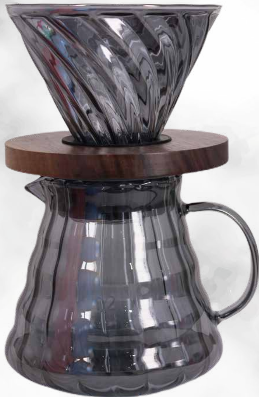
Item Nr.: GL-188 Capacity : 22oz , 650ml