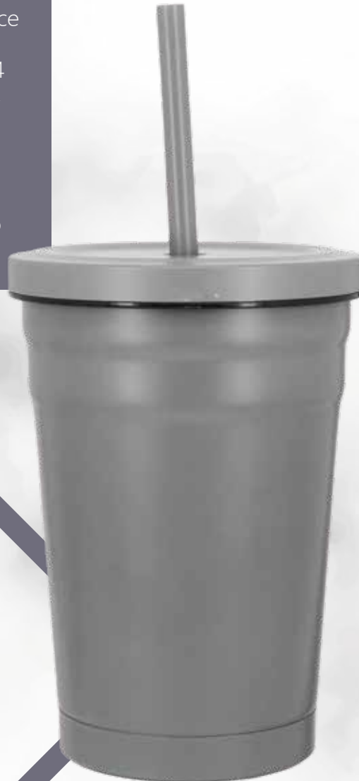
Item Nr.: SS-603 Capacity : 13oz , 390ml