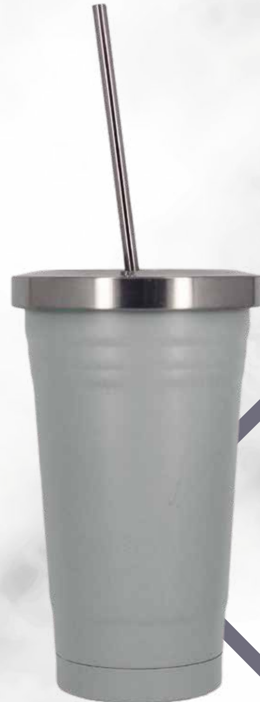
Item Nr.: SS-095A Capacity : 16.6oz , 470ml