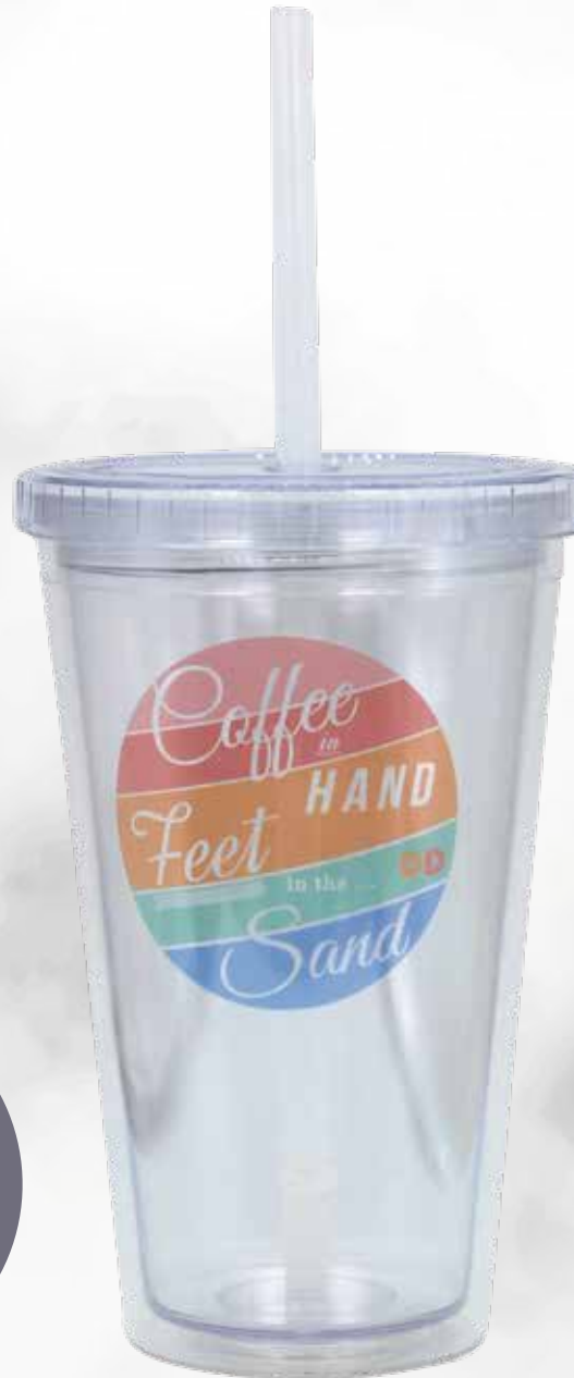
DP-381 16oz , 450ml