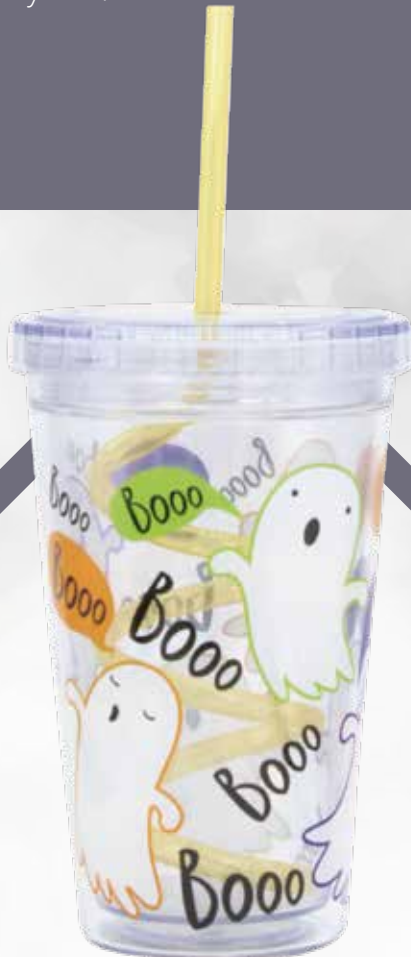
DP-380 10oz , 300ml