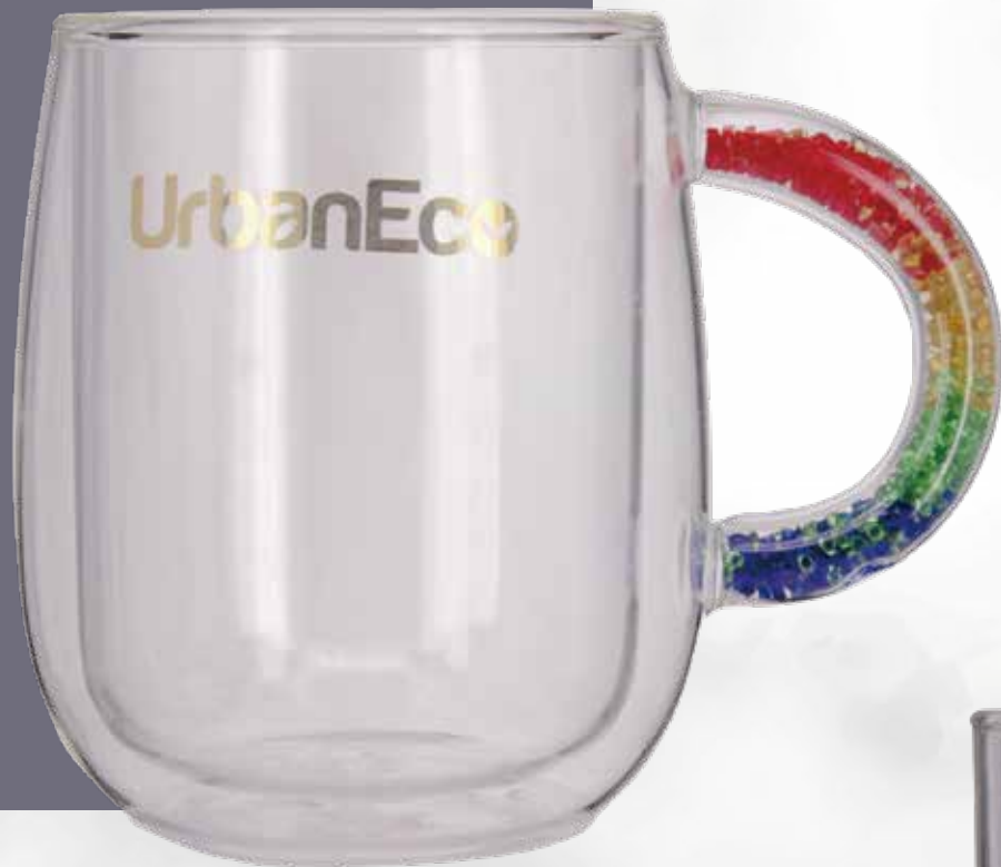
Item Nr.: GL-122A Capacity : 10oz , 300ml