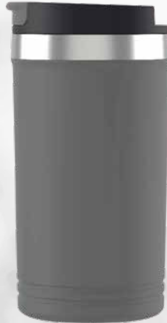
Item Nr.: SS-441 Capacity : 27oz , 810ml