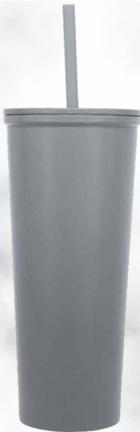
Item Nr.: SS-521 Capacity : 23oz , 690ml