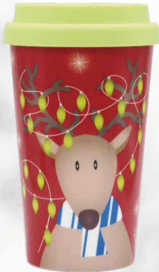
DP-378 14.5oz , 413ml