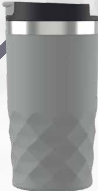
Item Nr.: SS-440 Capacity : 12oz , 360ml