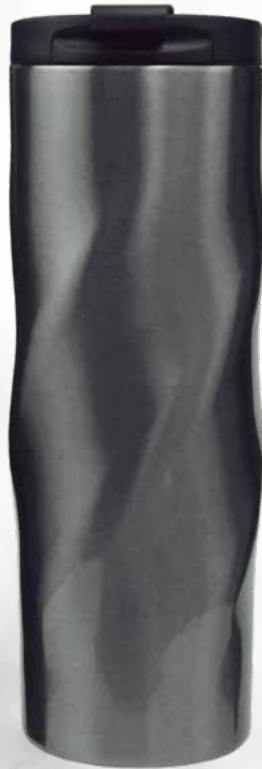
Item Nr.: SS-190 Capacity : 17oz , 480ml