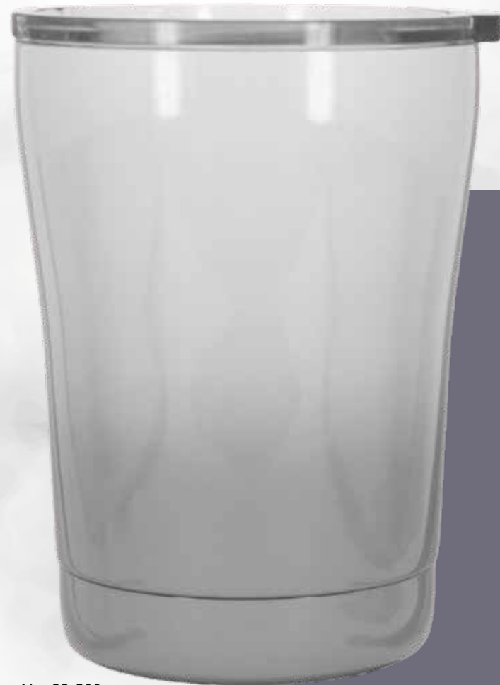
Item Nr.: SS-598 Capacity : 11oz , 330ml