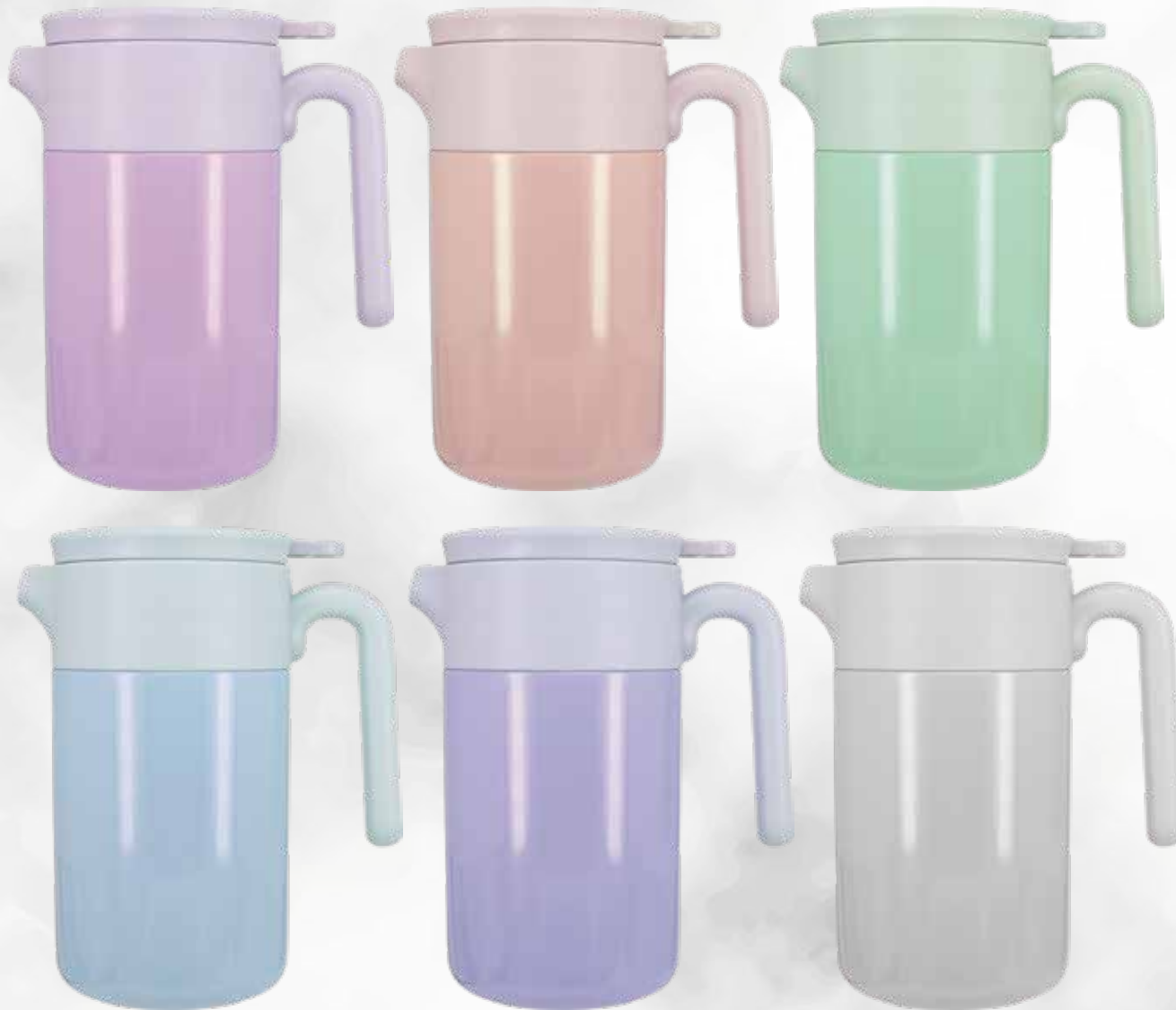
Item Nr.: SS-757 Capacity : 33.5oz , 1000ml