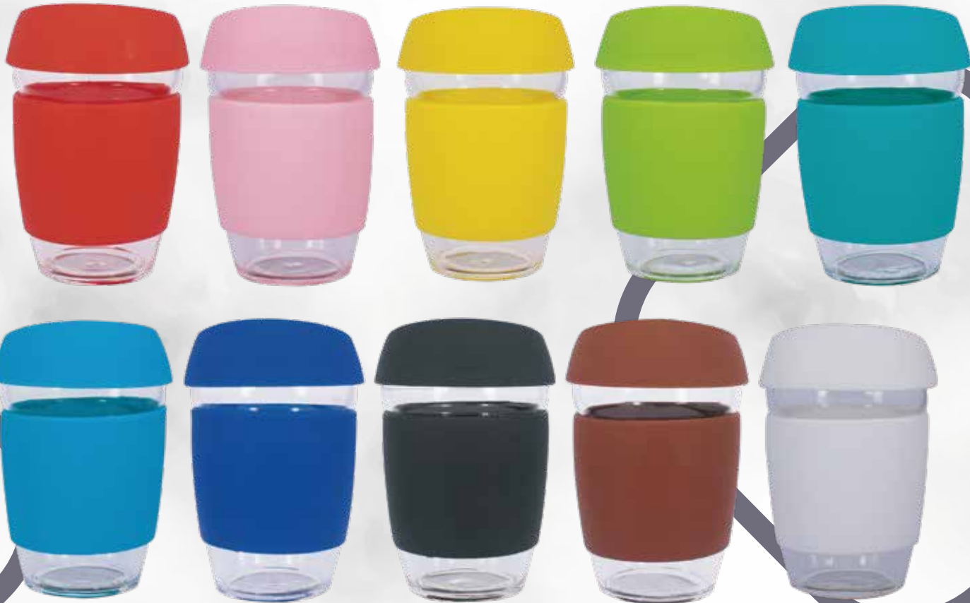
Item Nr.: GL-149 Capacity : 12oz , 360ml