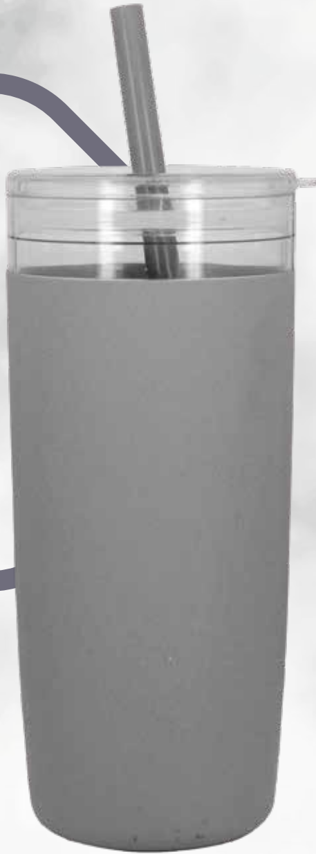
Item Nr.: DP-390 Capacity : 32oz , 960ml