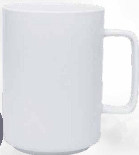
Item Nr.: CER-156 Capacity : 16oz , 480ml