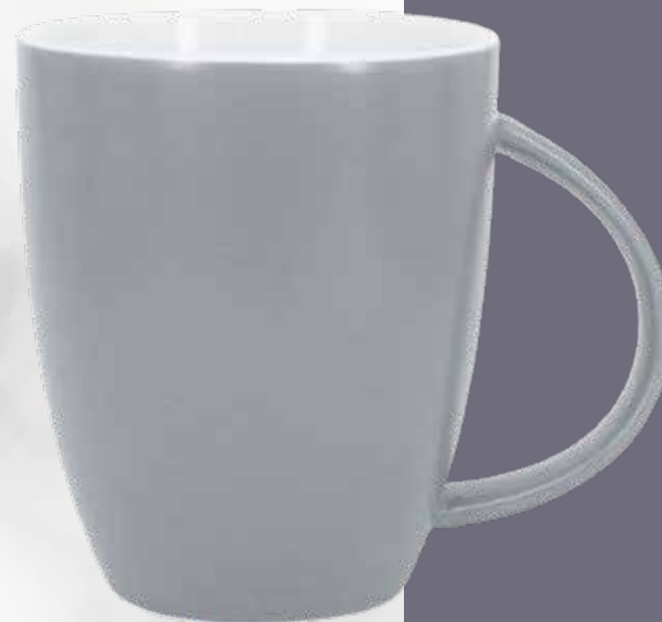
Item Nr.: CER-154 Capacity : 10oz , 300ml