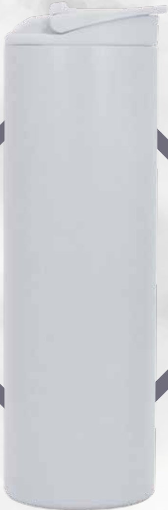
Item Nr.: SS-552 Capacity : 16oz , 470ml