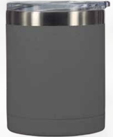
Item Nr.: SS-439 Capacity : 14oz , 420ml