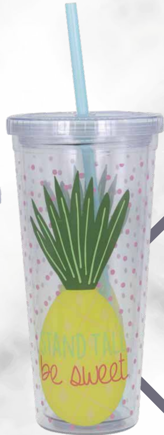
DP-382 21oz , 630ml