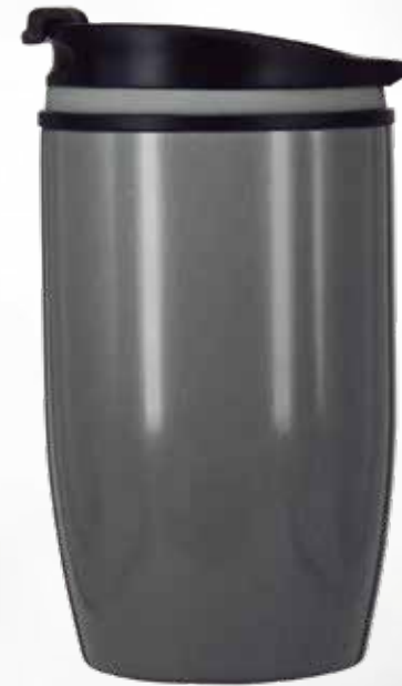
Item Nr.: SS-457 Capacity : 11oz , 330ml