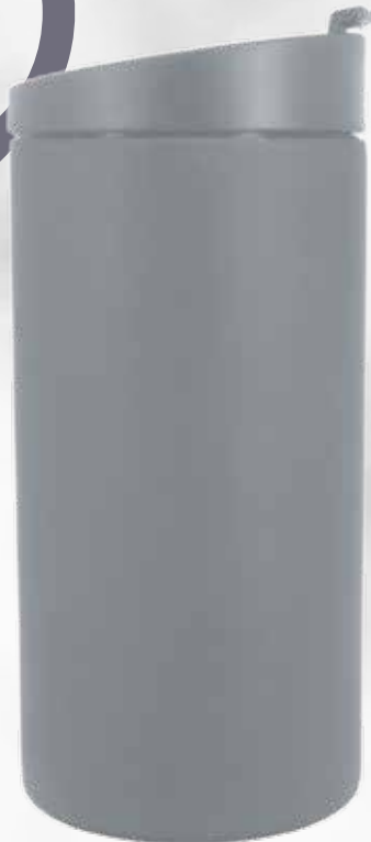
Item Nr.: SS-490A Capacity : 12oz , 360ml