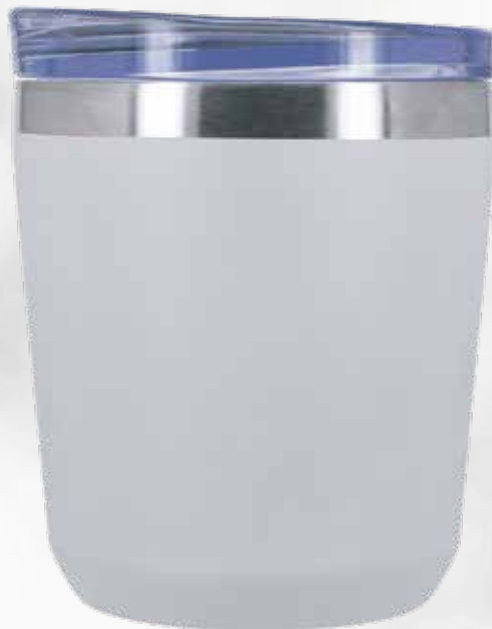
Item Nr.: SS-641 Capacity : 8oz , 240ml