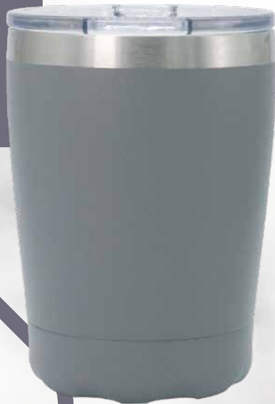
Item Nr.: SS-568 Capacity : 12oz , 360ml