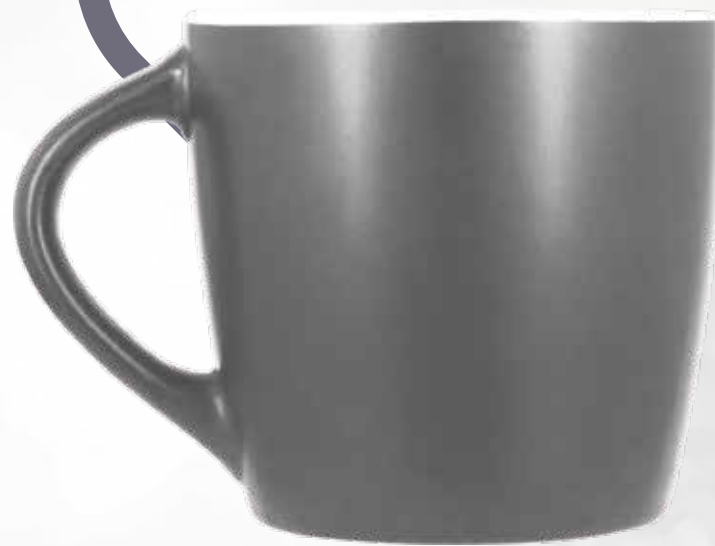
Item Nr.: CER-164 Capacity : 10oz , 300ml