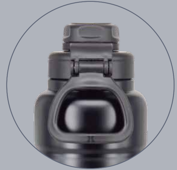
Item Nr: SS-458 Capacity : 40oz , 1200ml