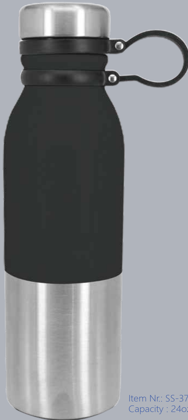
Item Nr.: SS-374A Capacity : 24oz , 720ml