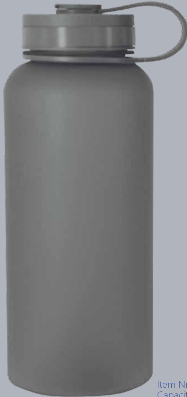
Item Nr: TR-432 Capacity : 42.5oz , 1200ml