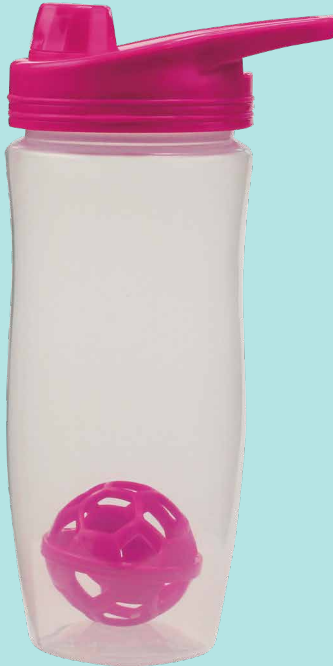
Item Nr.: TR-156P Capacity : 21oz , 620ml