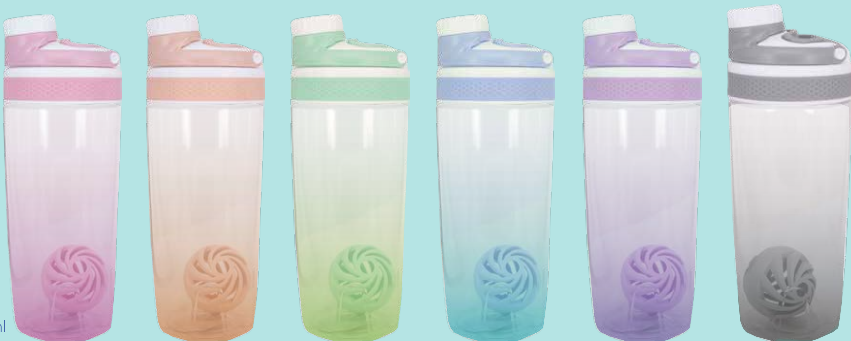
Item Nr.: TR-401 Capacity : 19oz , 570ml