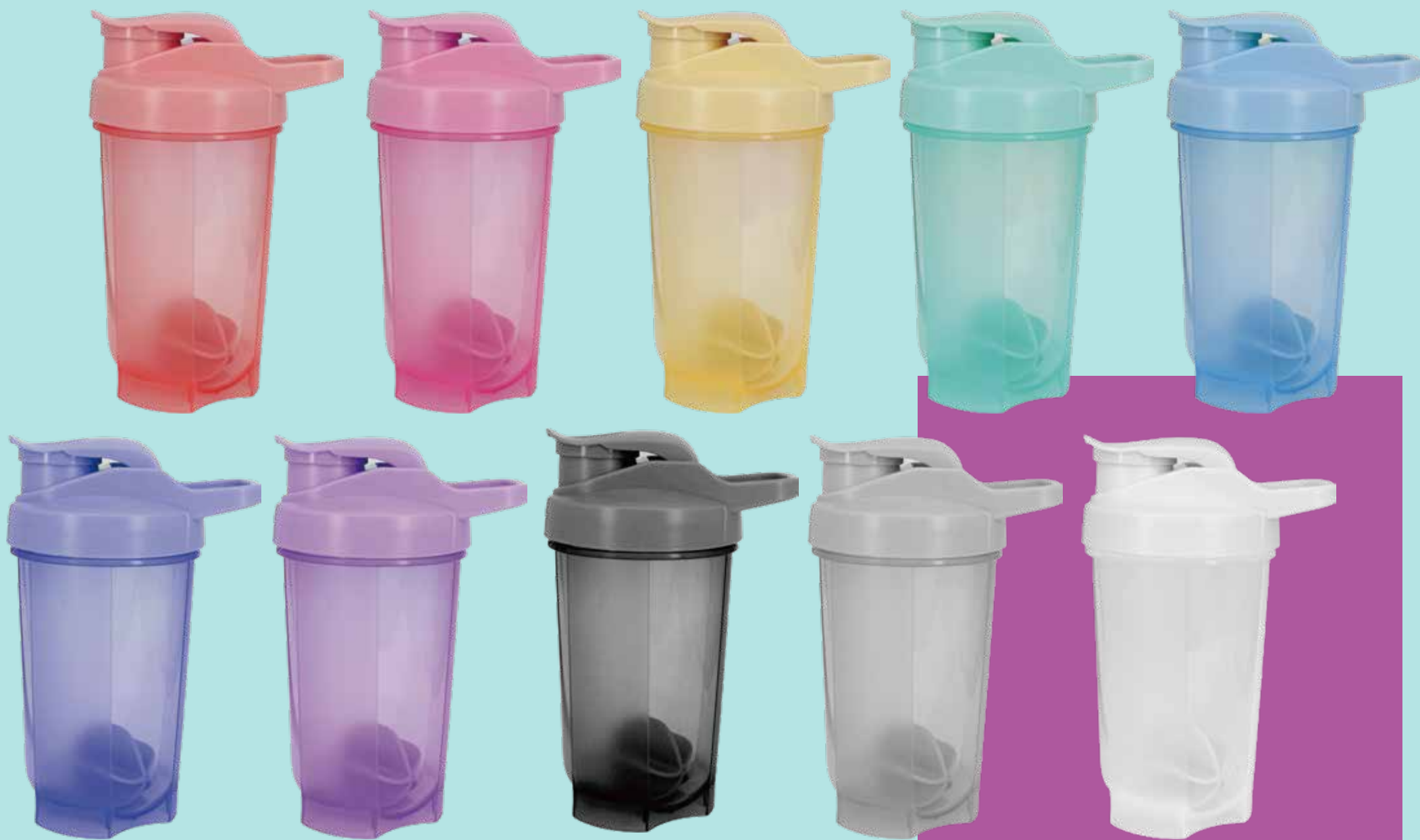
Item Nr.: TR-408 Capacity : 17.5oz , 520ml