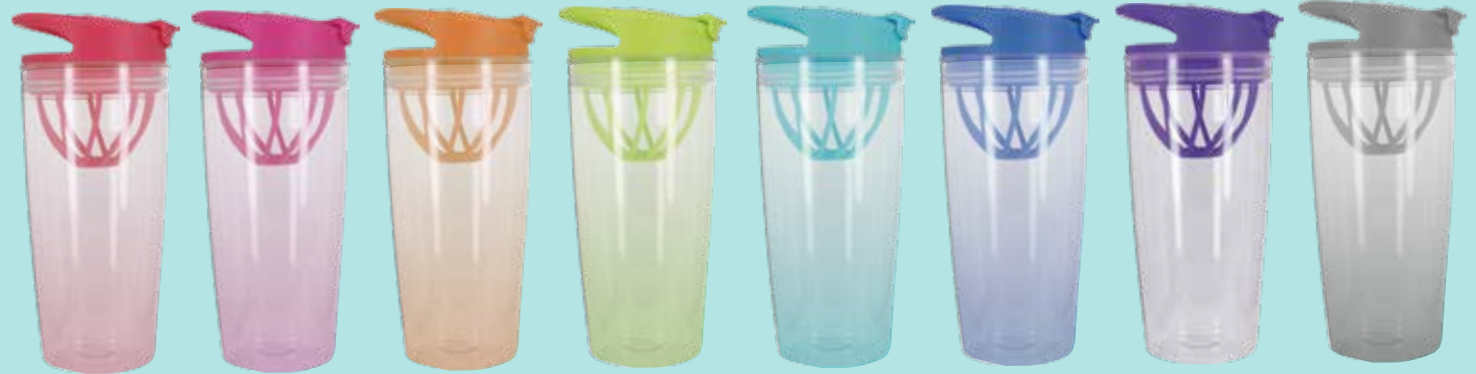
Item Nr.: TR-290A Capacity : 25oz , 700ml