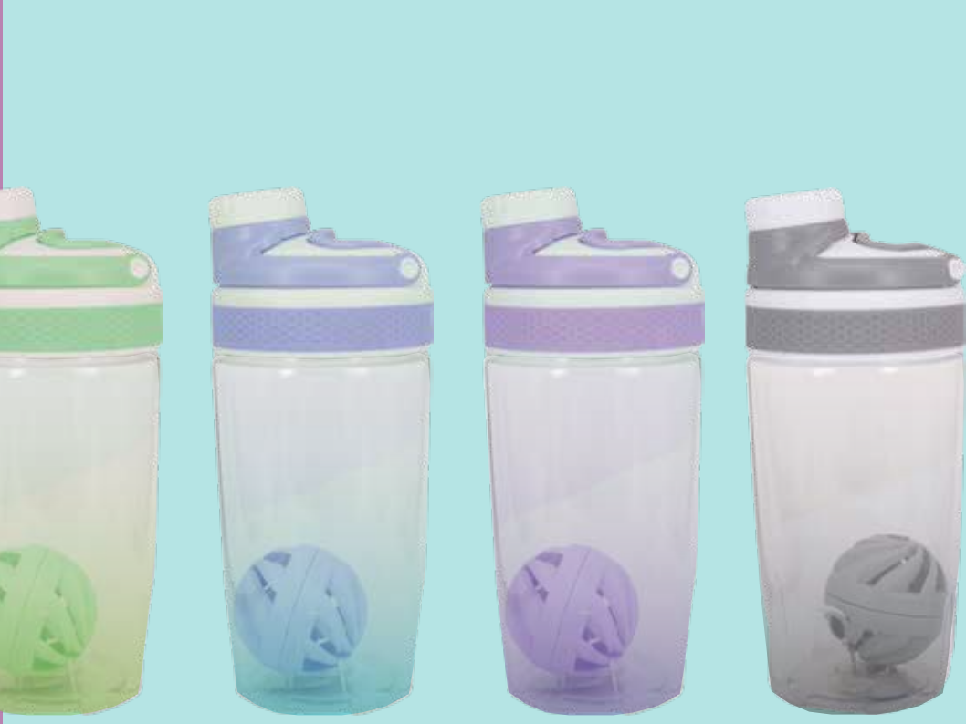
Item Nr.: TR-400 Capacity : 90oz , 2700ml