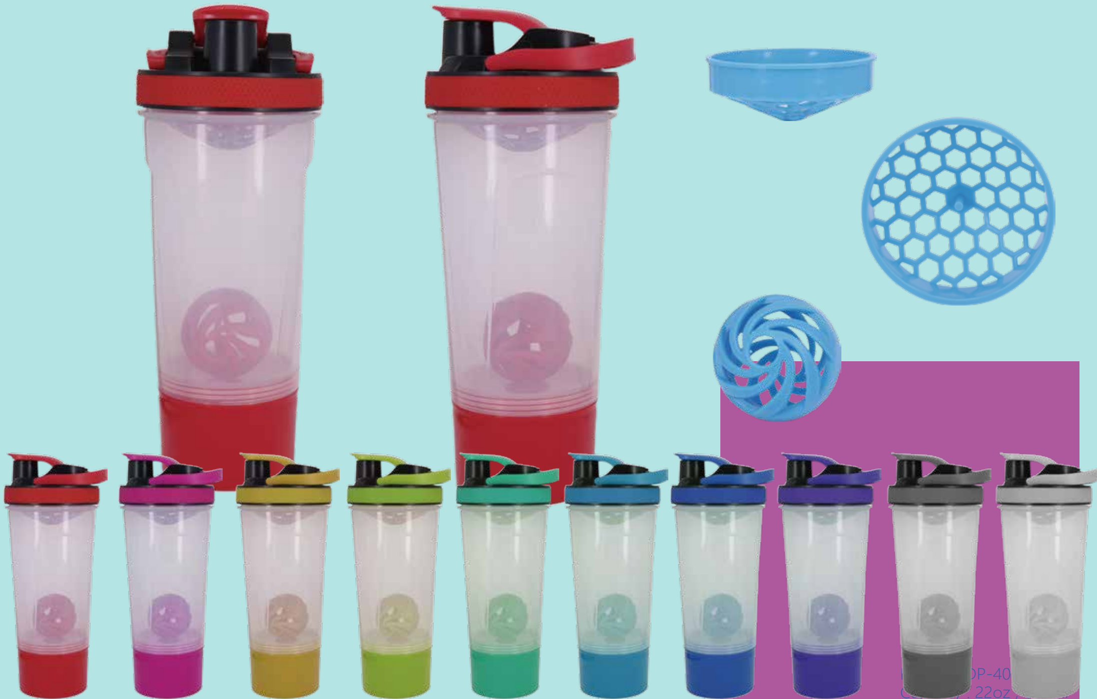
Item Nr.: TR-395 Capacity : 26oz , 780ml