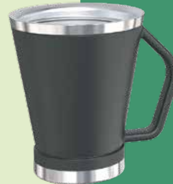
10oz Double wall Cup