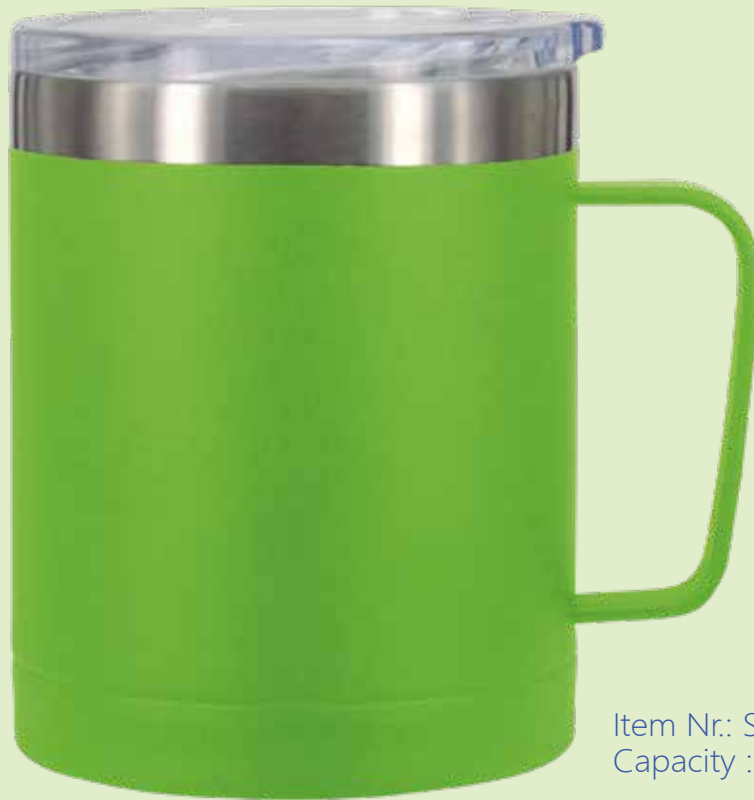
Item Nr: SS-367A Capacity : 14oz , 420ml