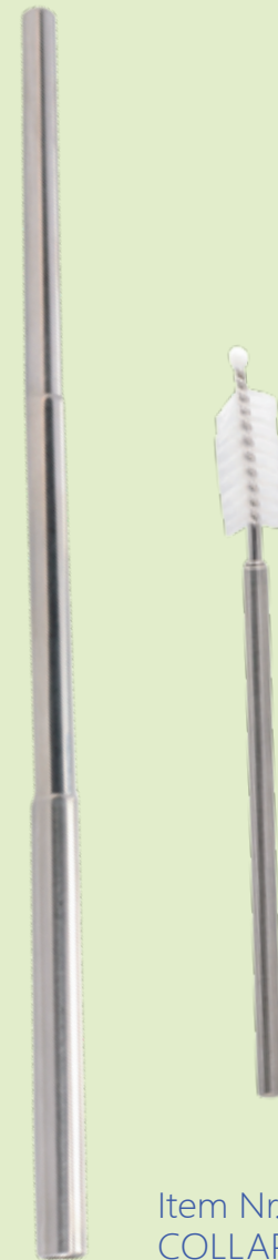
Item Nr: SC-063 COLLAPSIBLE STRAW SET