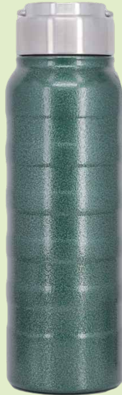
Item Nr: SS-578 Capacity : 24oz , 720ml