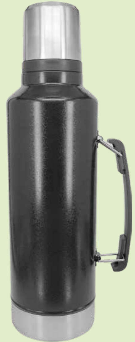
SS-711 70oz , 2100ml