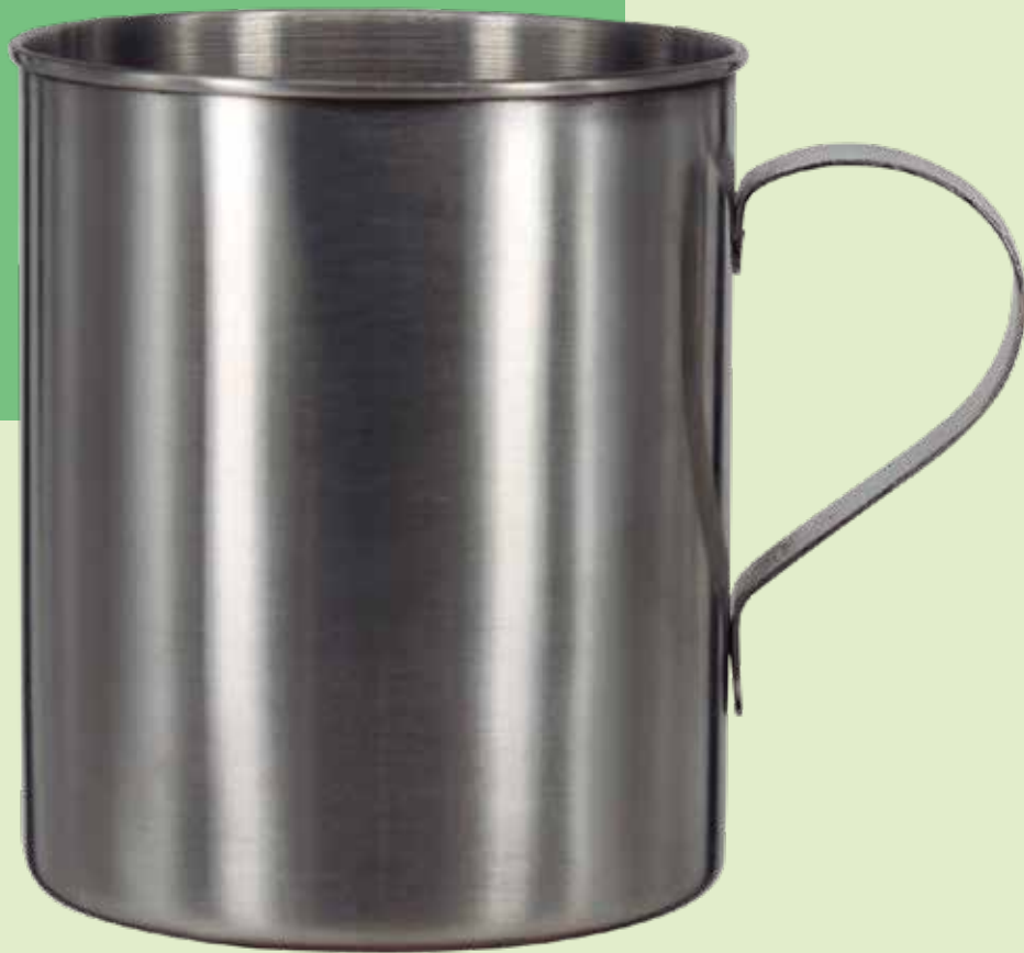
Item Nr: SB-104 Capacity : 15oz , 450ml