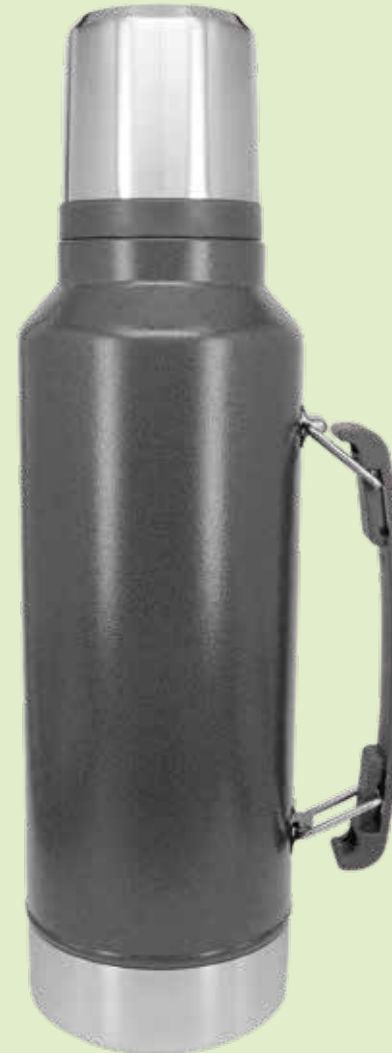
SS-710 50oz , 1500ml