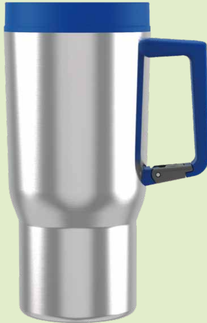
Item Nr: SP-140 Capacity : 20oz , 600ml