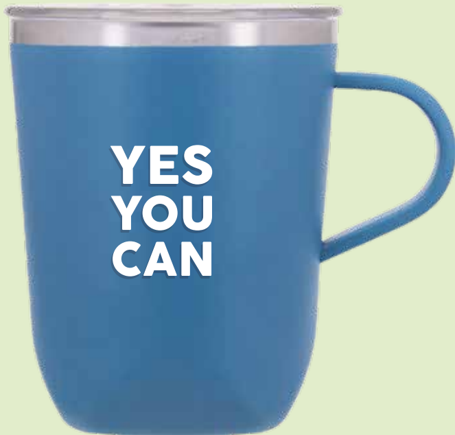
Item Nr.: SS-720 Capacity : 9oz , 270ml