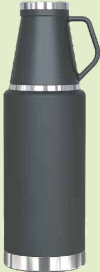
SS-566 51oz , 1500ml