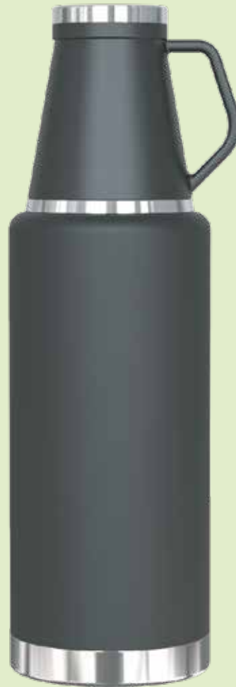
SS-567 64oz , 1900ml