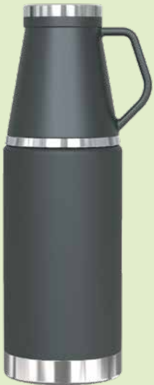
SS-565 34oz , 1000ml