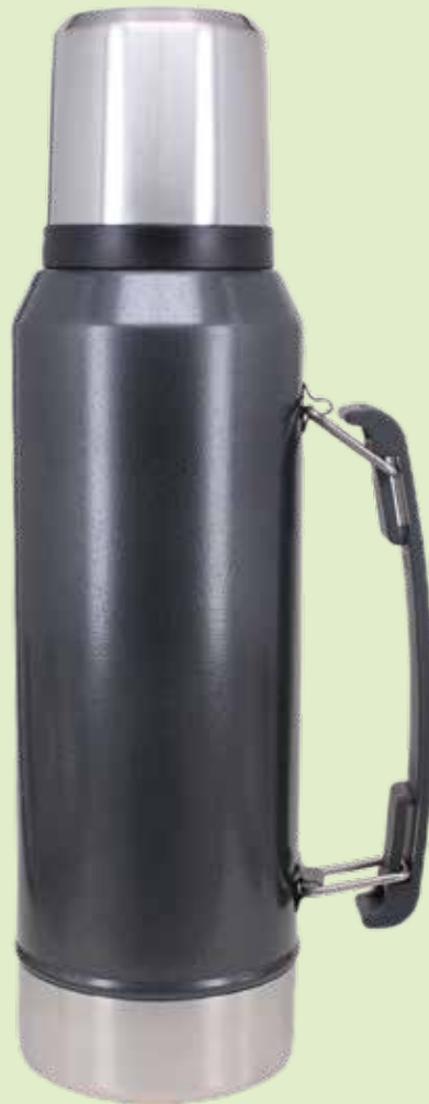
SS-709 33oz , 980ml