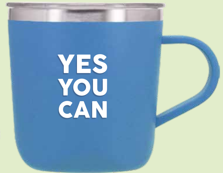
Item Nr.: SS-721 Capacity : 7oz , 210ml