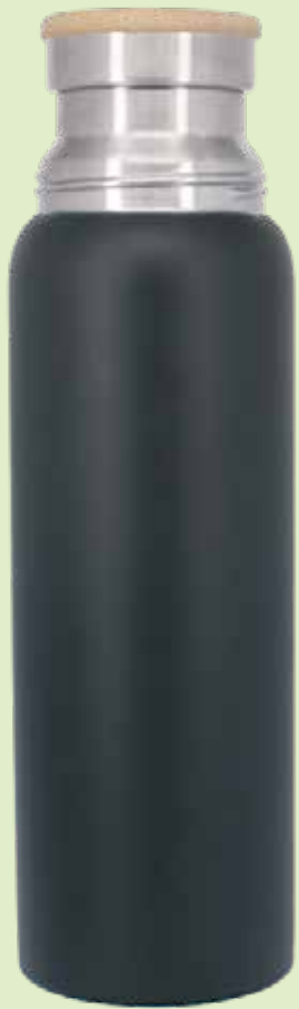
5.4oz double wall can keep hot and cold cup