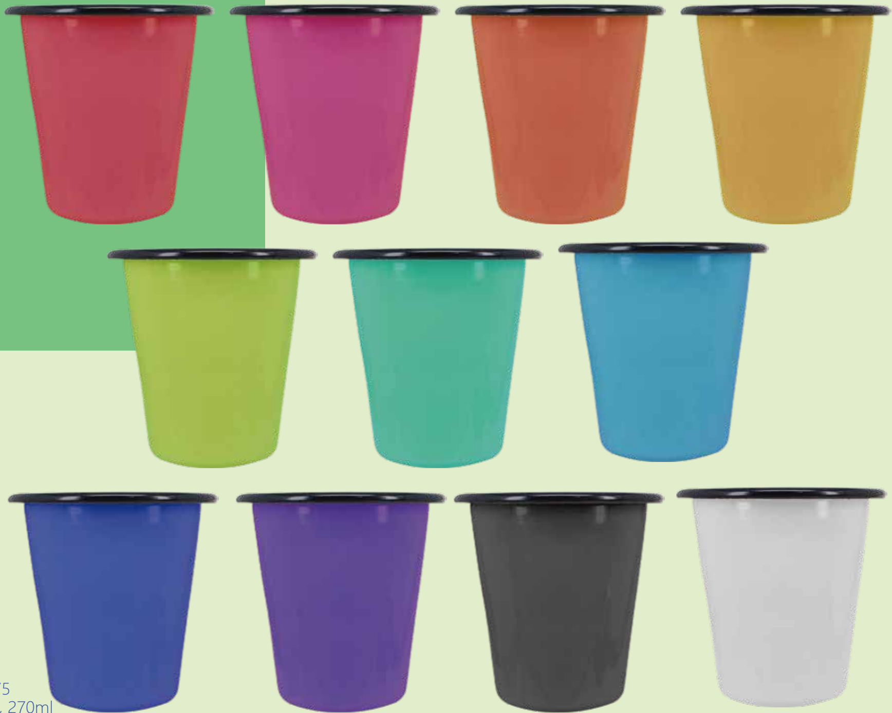
Item Nr.: SC-075 Capacity : 9oz , 270ml