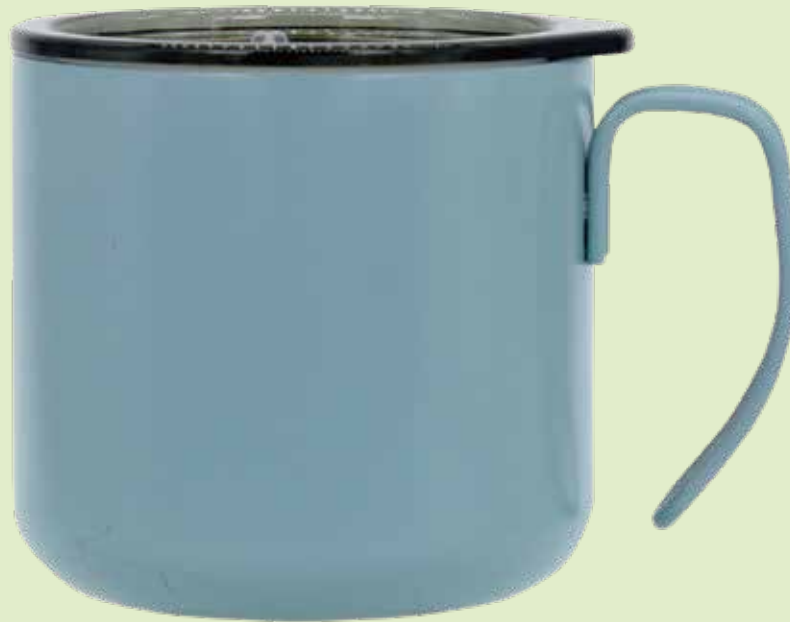
Item Nr.: SS-540 Capacity : 11oz , 330ml