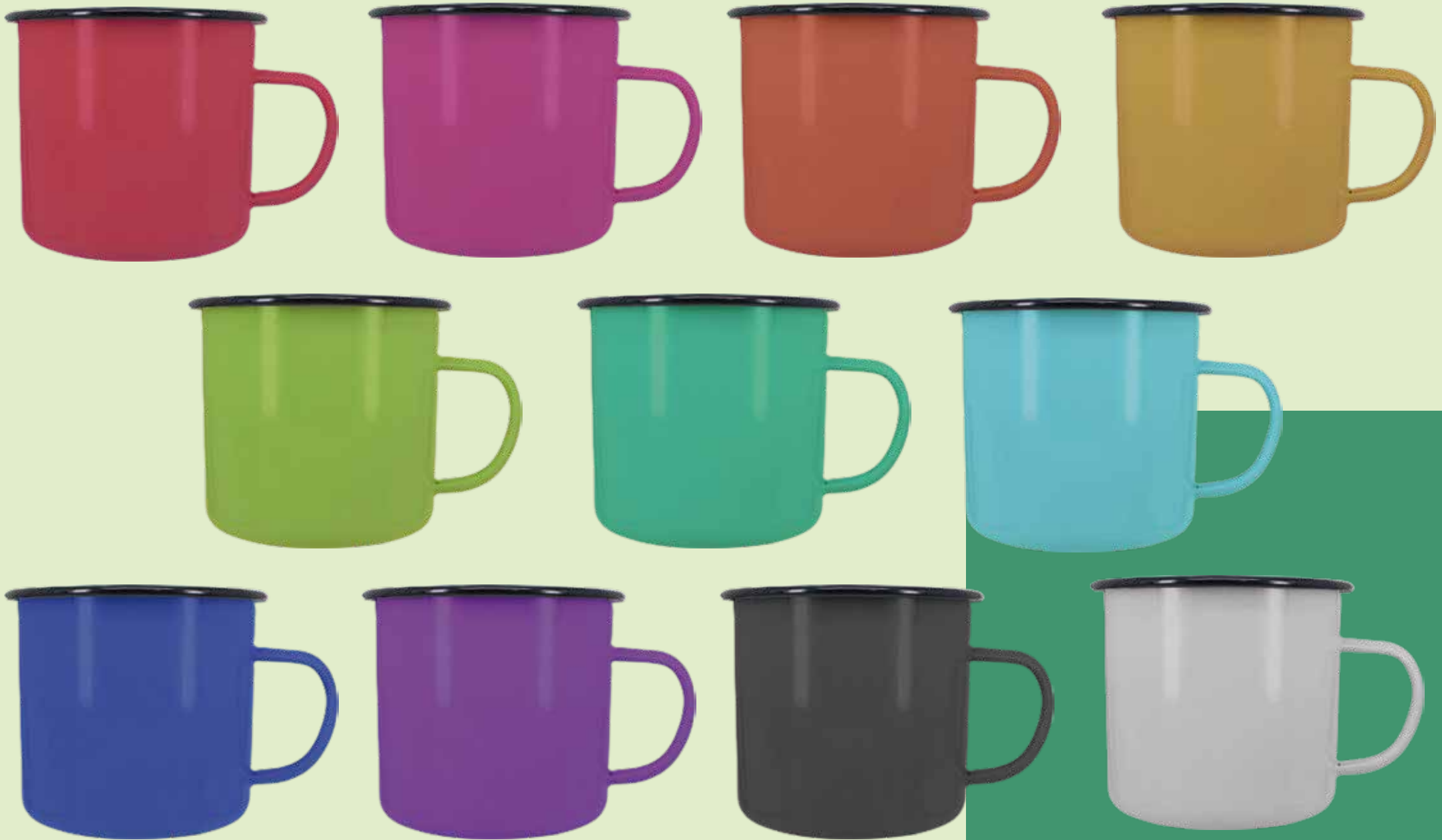
Item Nr: SC-076 Capacity : 22oz , 660ml