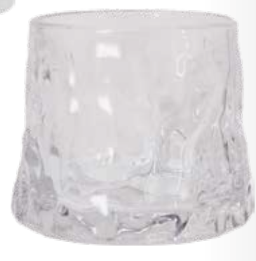
GL-195 5oz , 150ml