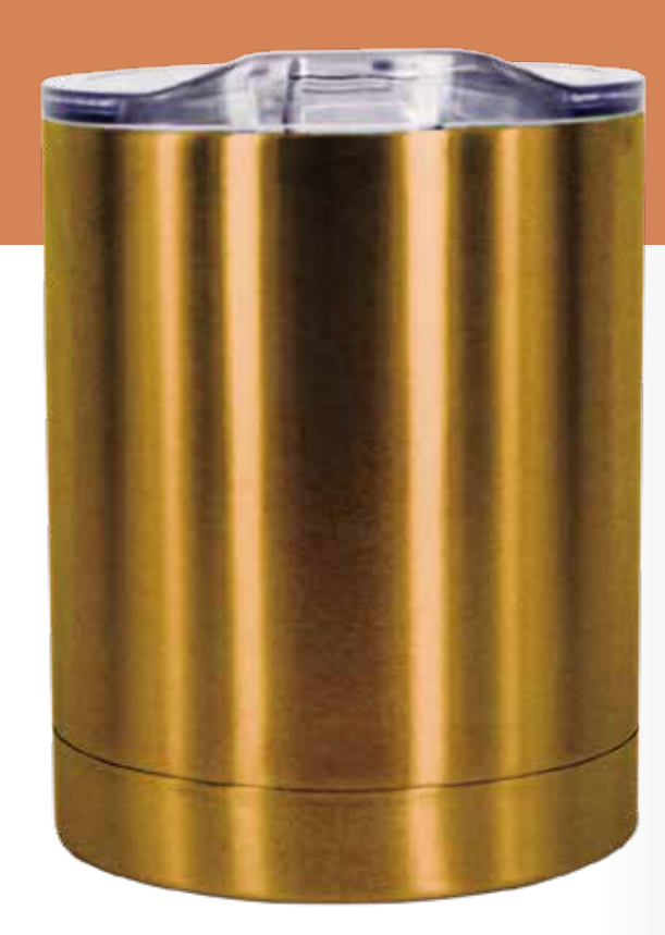
SS-205A 9oz 260ml