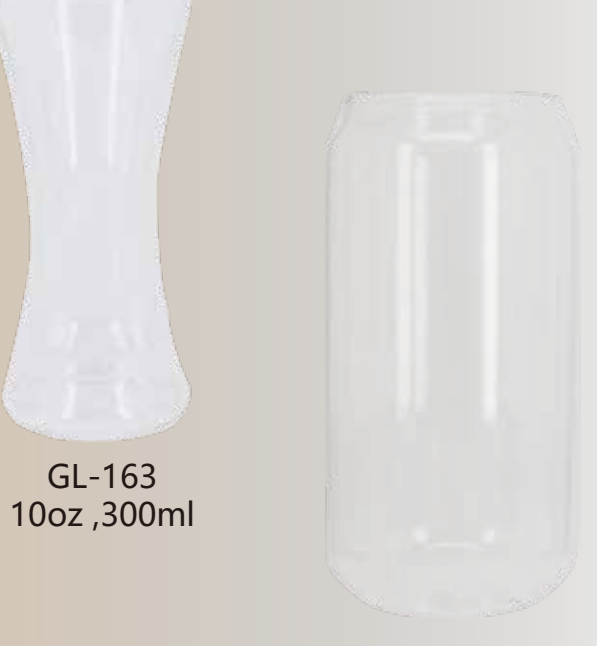
GL-180 18.5oz ,500ml