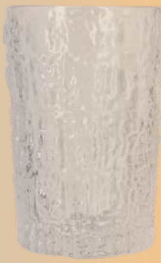
GL-192 8oz , 240ml