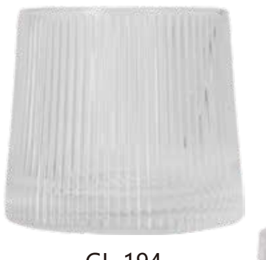
GL-194 5oz , 150ml